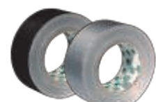
GAF-505-BK / SV